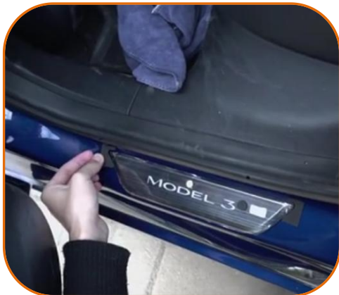
2.Put the positioning sticker on the corresponding position

The subsequent installation steps is the same as before