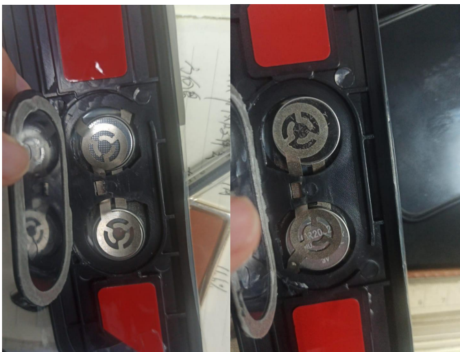
battery position for front door sill

The subsequent installation steps is the same as before