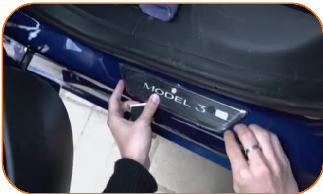
1.Align the installation position