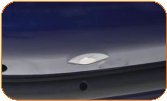
6.magnet stick on the door