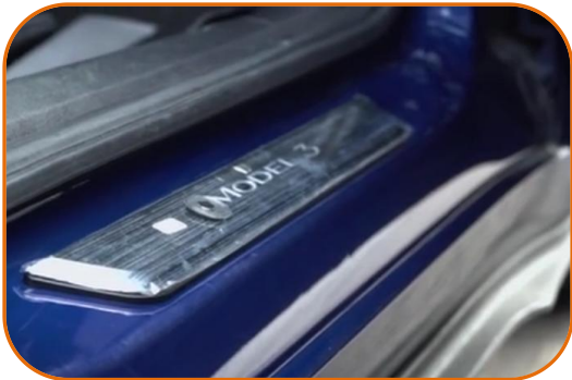
5.Close the door and the large black rubber with magnet will stick to the door