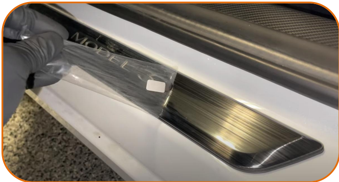
7.Tear off the plastic film