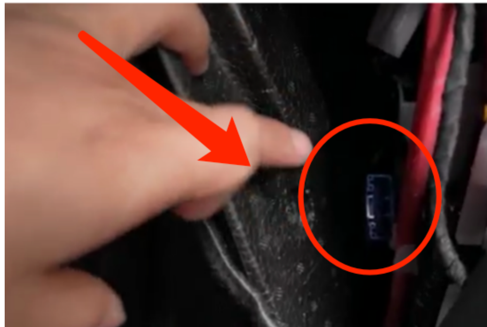
New Model 3/Y Adapter