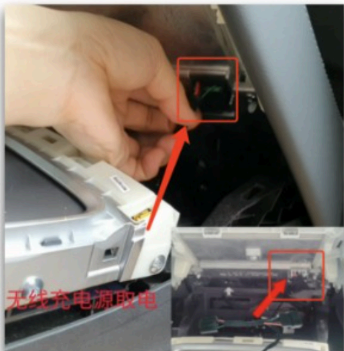
Black: Wireless charger connector to take power