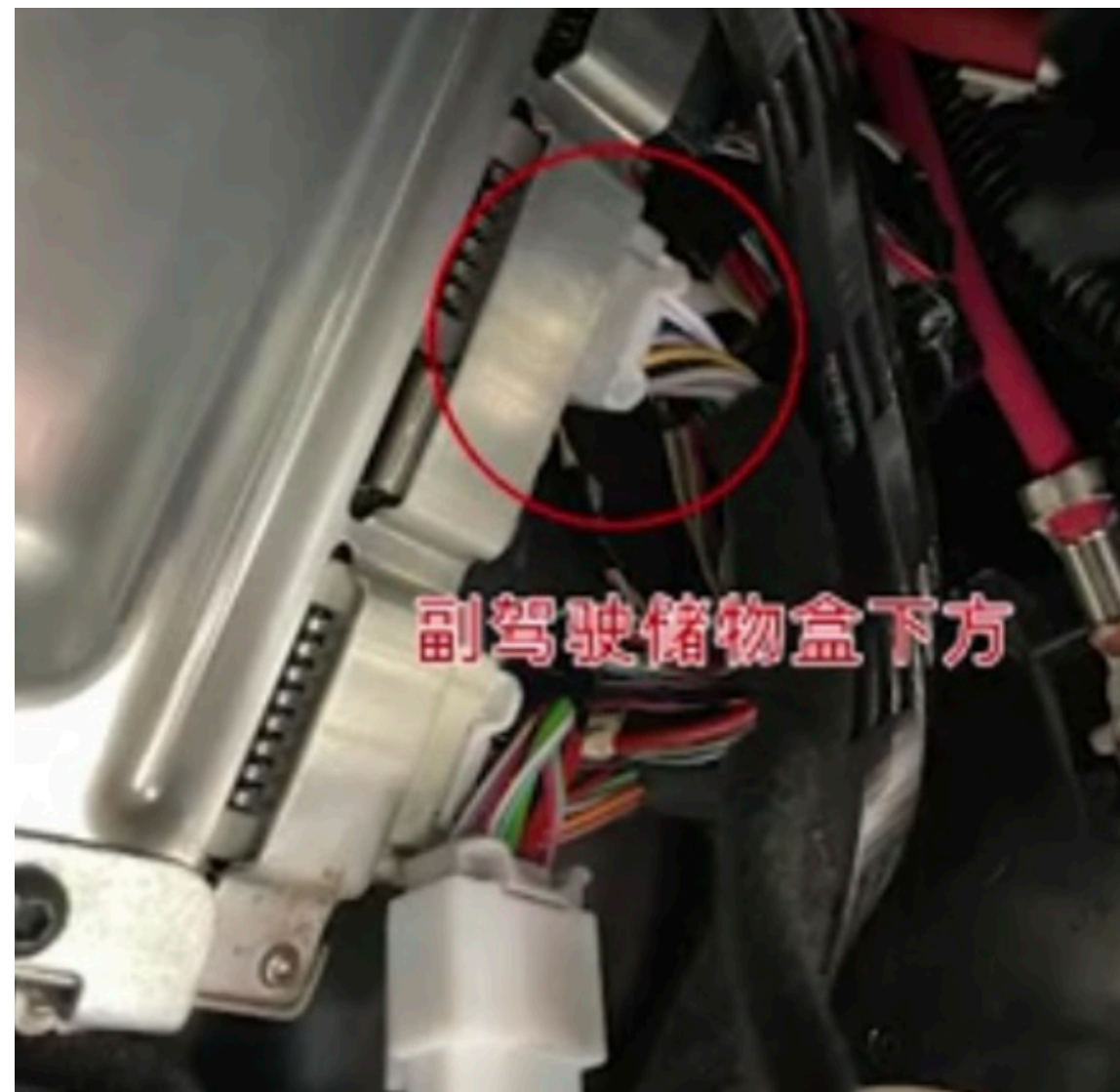
Old Model 3/Y Adapter