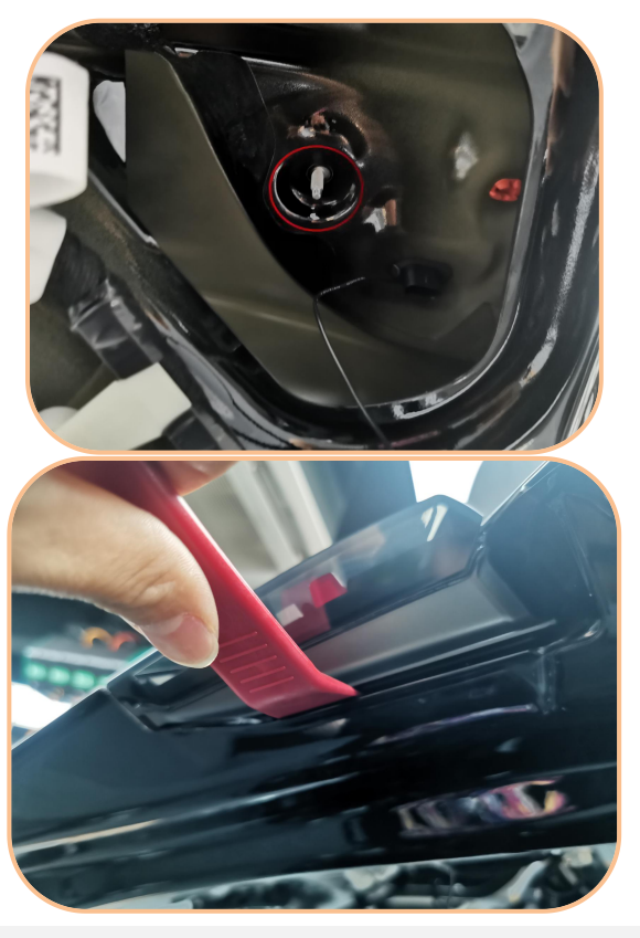
6.Unscrew the nut of the upper tail light, pry out the upper tail light and replace it with tail lamp C &D