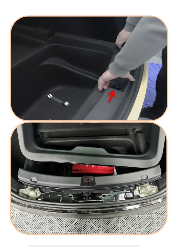
1. First remove the trunk interior trim pad