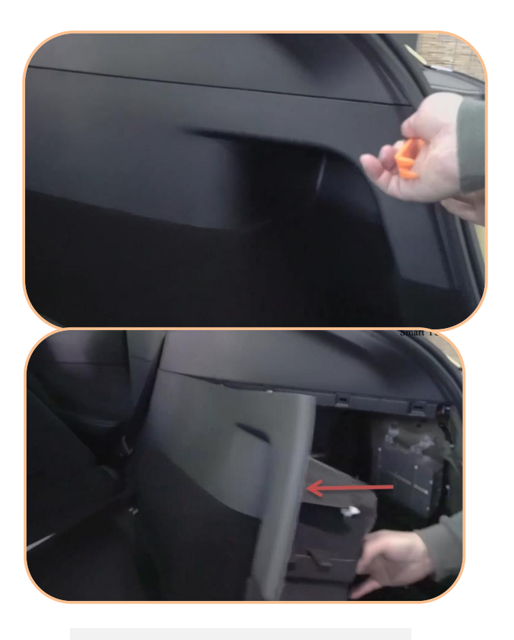
3. Pry off the trim panel cover on the right (the same operation on the left)