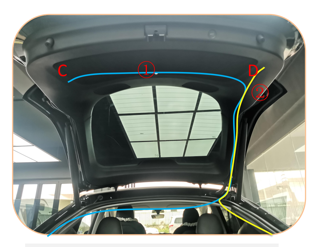
8. After pulling the harness to the upper tailgate, pull it to the corresponding position and connect the plugs according to the instructions in the picture