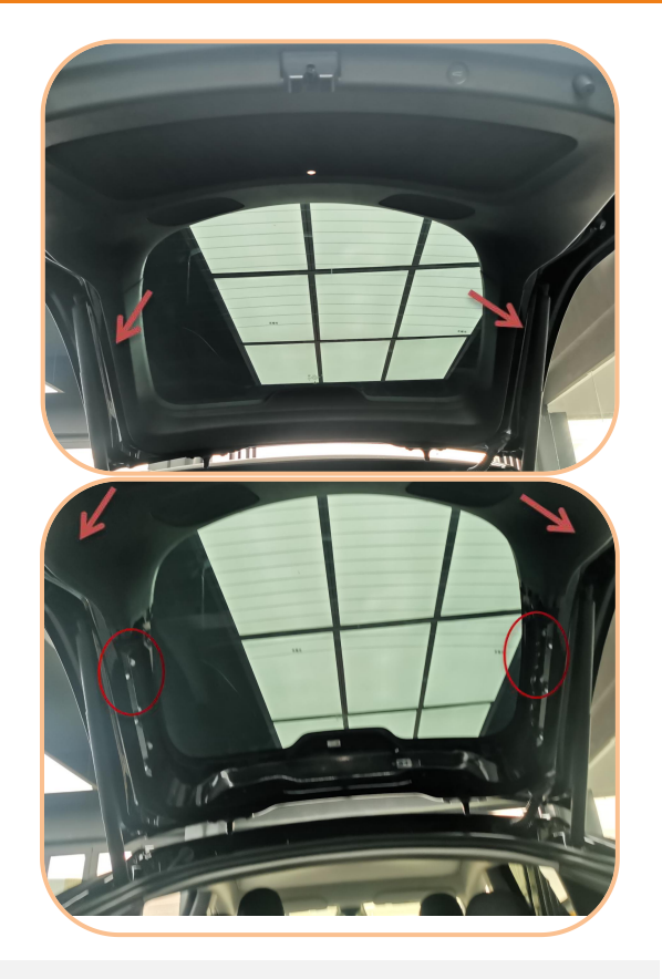
5. First remove the upper cover and the left and right buckles, and then remove the trim panel cover