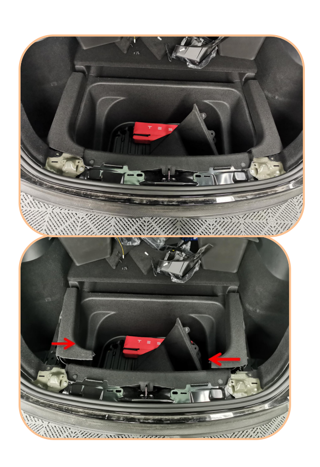
2. Remove the trim cover