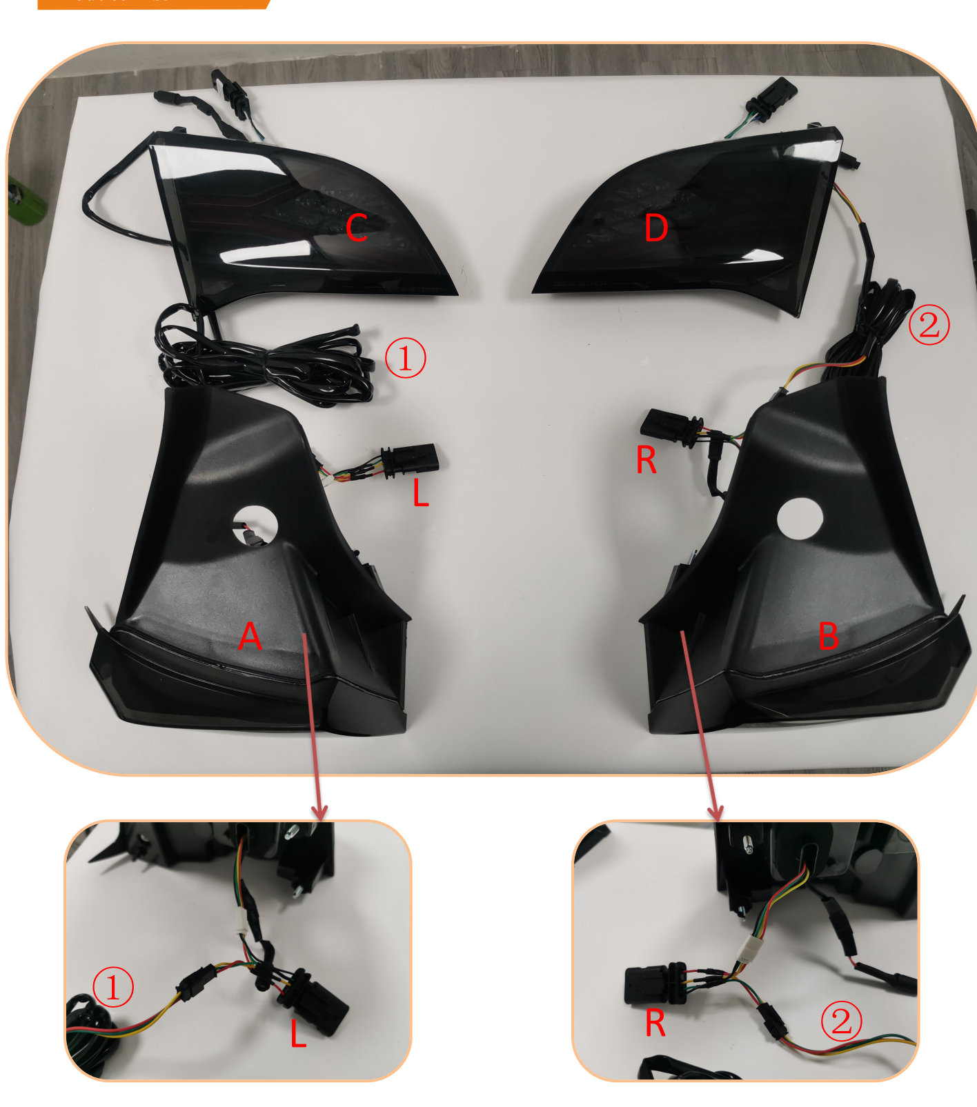
A - Wiring diagram of left lower tail light