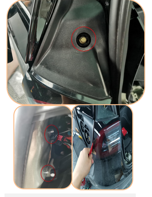
4. Pry off the rear tail light cover, unscrew two nuts on the interior trim panel, and then remove the tail light (the same operation on the left)