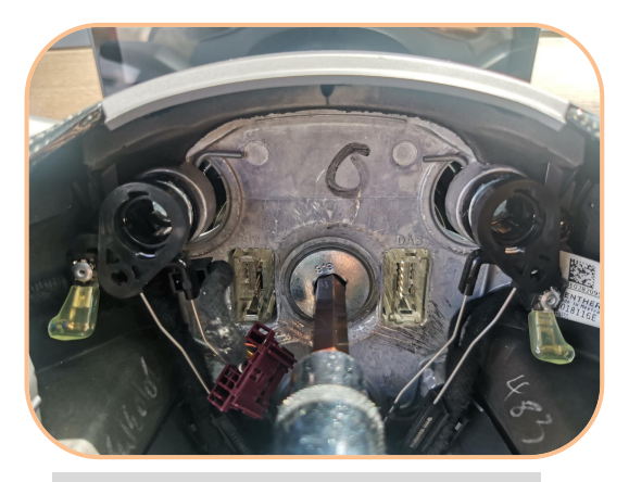
7. Screw out the steering wheel screw with a large H10 wrench.