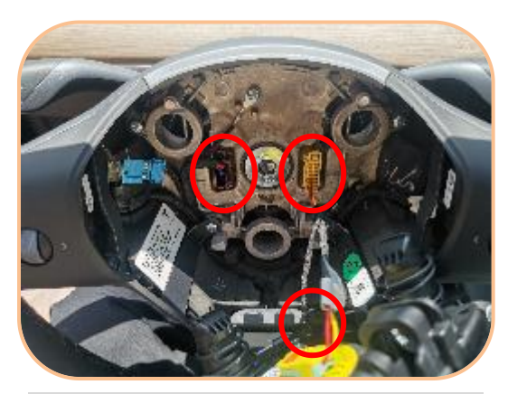
5. Take out the airbag and pull out the airbag plug and steering wheel plug. then take off the airbag