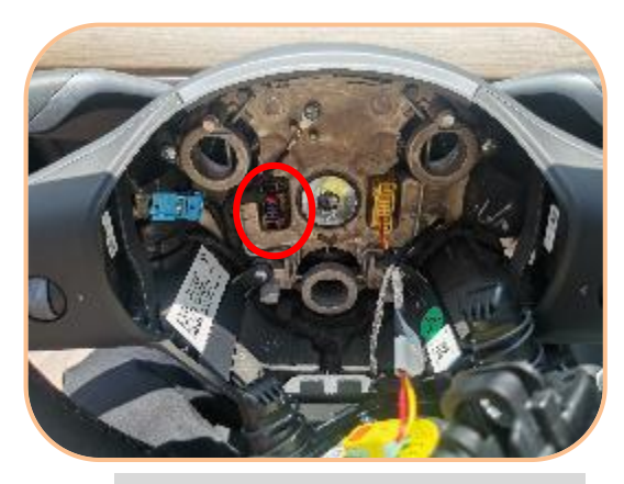
6. Note that the steering wheel plug must be pulled out to avoid pulling out the hairspring.