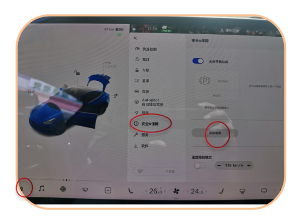
2. Turn off the host power in the vehicle setting.