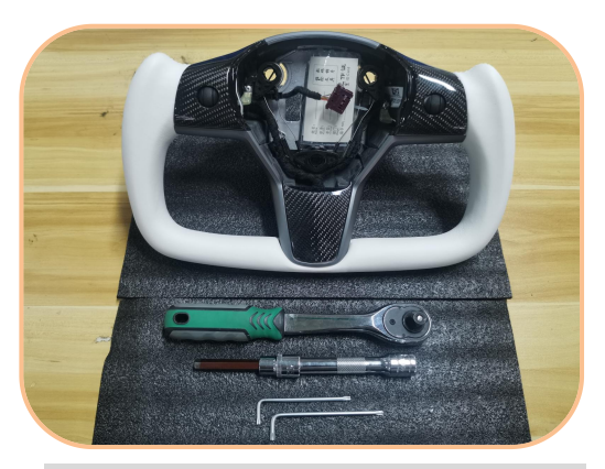
1.Productl list Steering wheel, large H10 wrench, 2 flat head screwdrivers.