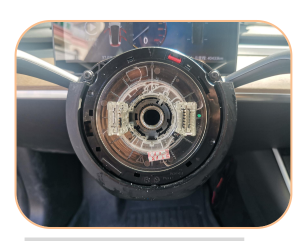
9. Do not turn the hairspring after pulling out the steering wheel.