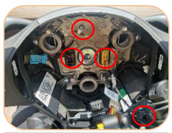
10. Then remove the harness of the original steering wheel and install it on the new steering wheel, then buckle the speaker harness and plug in the plug.