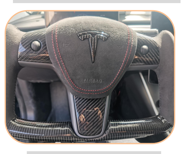
12. Test the speaker and buttons after installation.