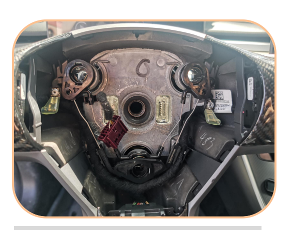
8. Then pull out the steering wheel. If the steering wheel is too tight, shake it left and right and pull it out slowly.