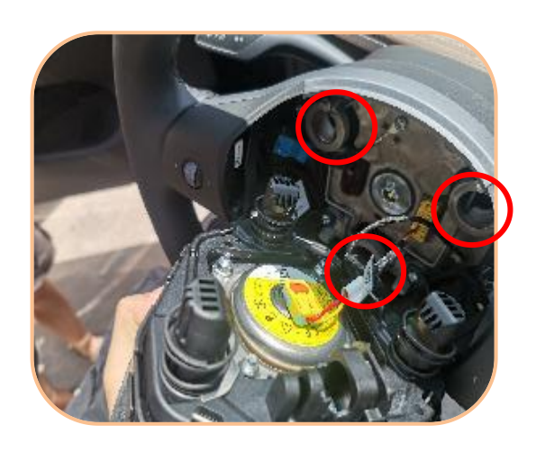
11. Finally, insert the airbag plug, and insert the airbag into the spring bayonet.