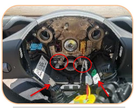
4. The internal diagram and spring schematic diagram of parallel screwdriver insertion.