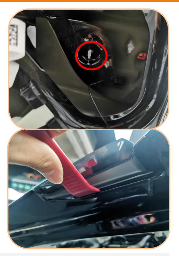
6.Unscrew the nut of the upper tail light, pry out the upper tail lamp and replace it with eagle eye taillight -C.D)