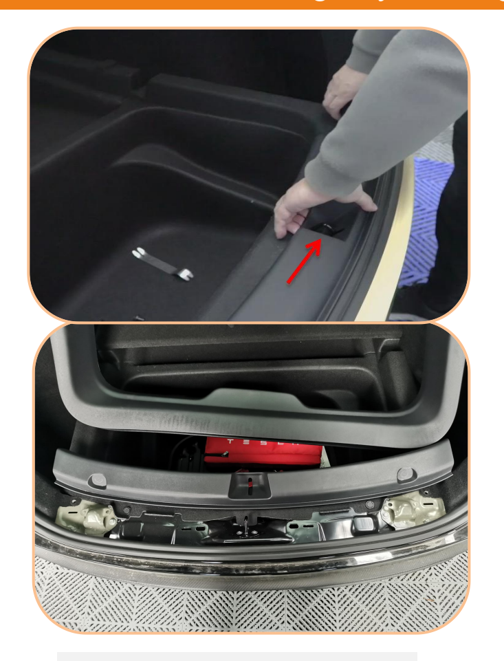
1. Remove the trunk interior trim panel