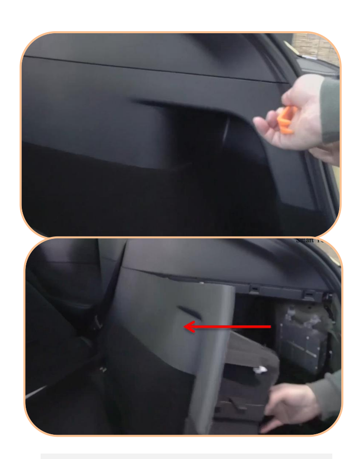
3. Pry the trim panel cover on the right (the same operation on the left)