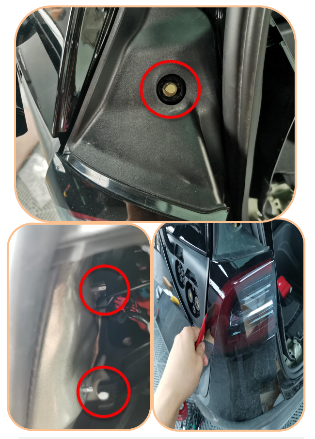
4. Pry off the rear tail light cover, unscrew two nuts on the interior trim panel, and then remove the tail light (the same operation on the left)