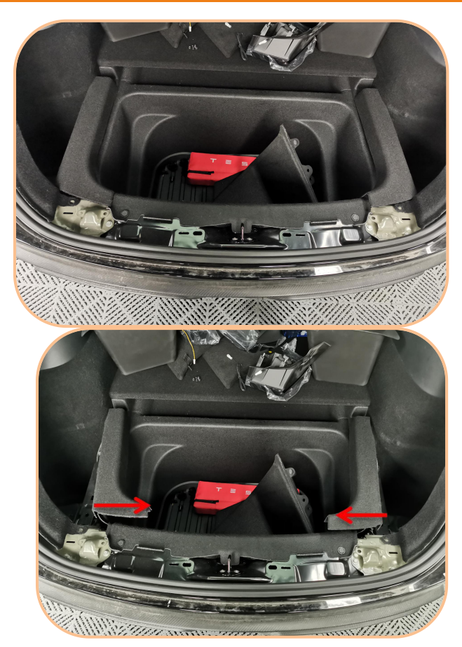
2. Remove trim cover