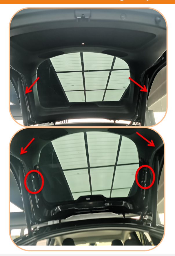
5. First remove the upper cover; remove the left and right buckles, and then remove the trim panel cover