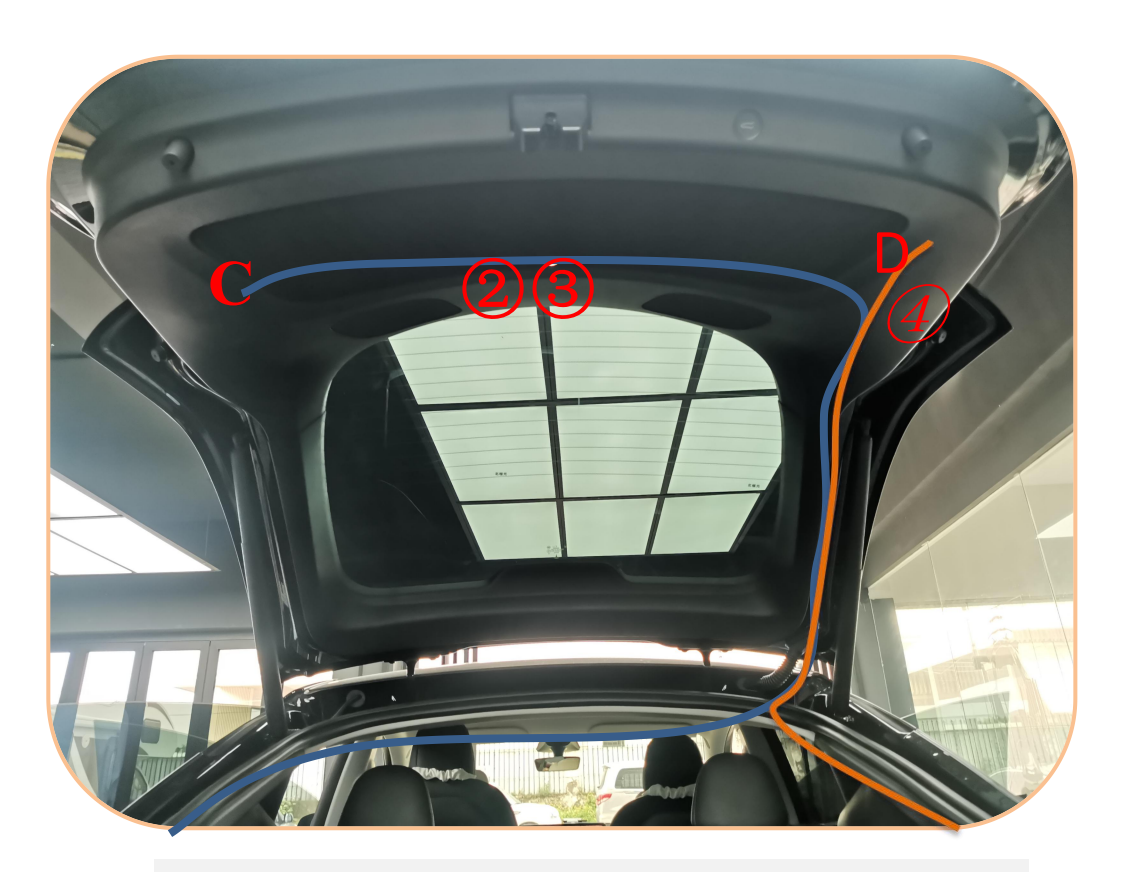
8.Route the wires to the upper tailgate and insert it at the corresponding position according to the indicates in the picture